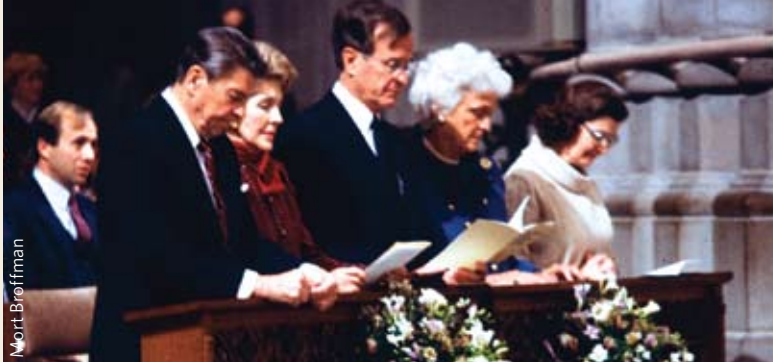
President Ronald Reagan and Vice President George H. W. Bush attend a prayer service marking their first inauguration, the first attended at the Cathedral by a president, 1981.

(above) President Jimmy Carter prays for the safe return of American diplomats taken hostage in Iran, 1979.