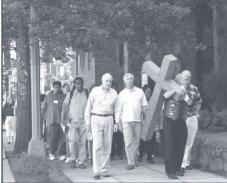
Stations of the Cross on the streets of Washington, DC.