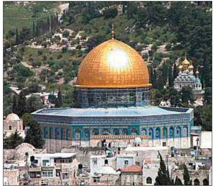
The Dome of the Rock in Jerusalem is a site that is sacred to followers of all the Abrahamic faiths.